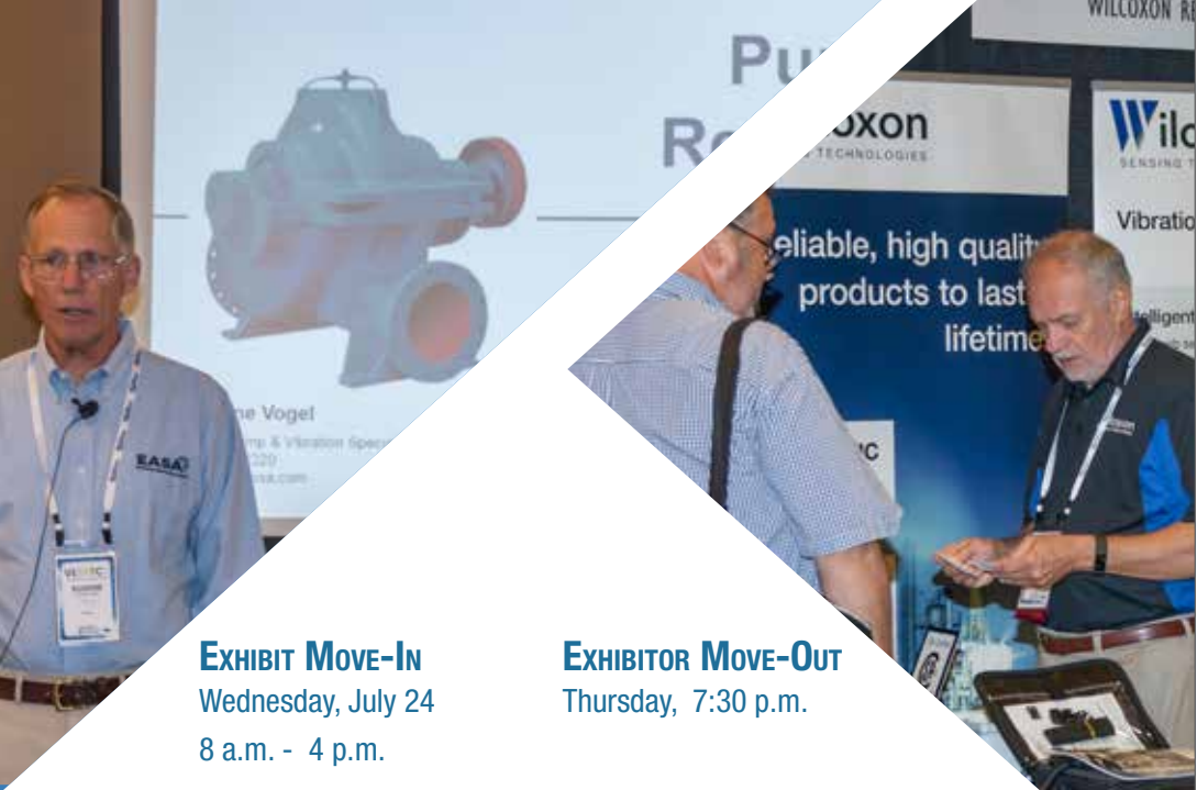
EXHIBIT MOVE-IN Wednesday, July 24 8 a.m. - 4 p.m.